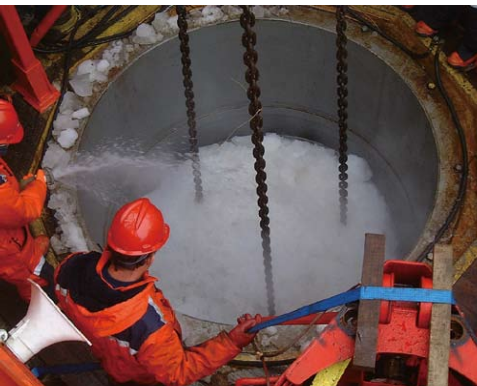
Figure 2. Clearing the moonpool to start work at the first site.

On a normal drilling expedition, the next step would be to get on site and start drilling. Arctic conditions put a different slant on this. First, we had to be escorted to site, find a suitable ice-management plan for staying on location, remove all ice which had accumulated in the moonpool on transit (Fig. 2), fit the ice protection