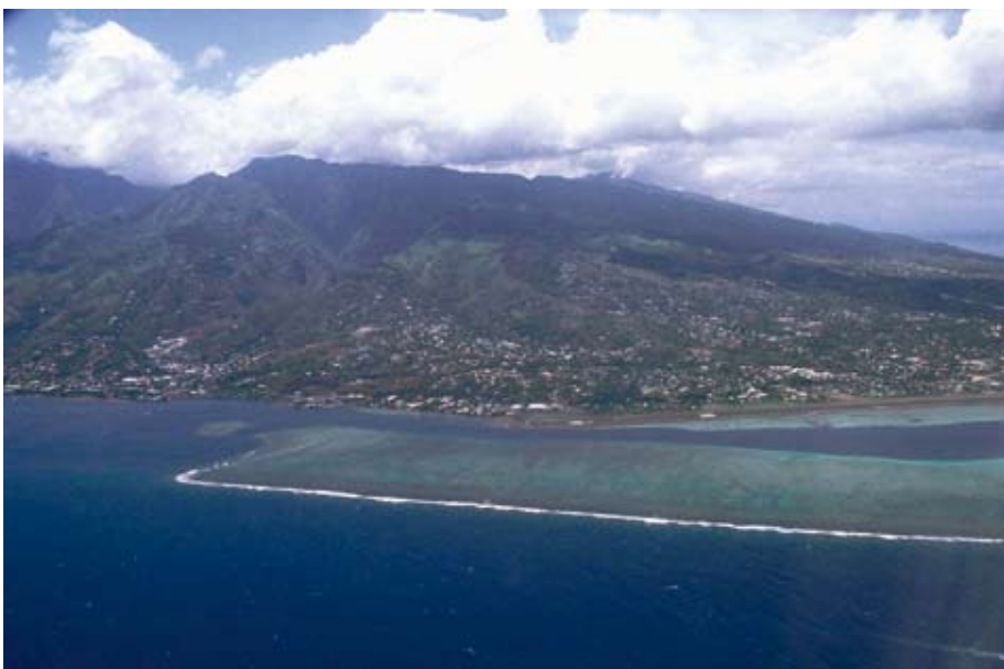
Figure 6. A potential drilling site of IODP Expedition 310 offshore Papeete (Tahiti).

http://www.ecord.org/exp/tahiti/310.html