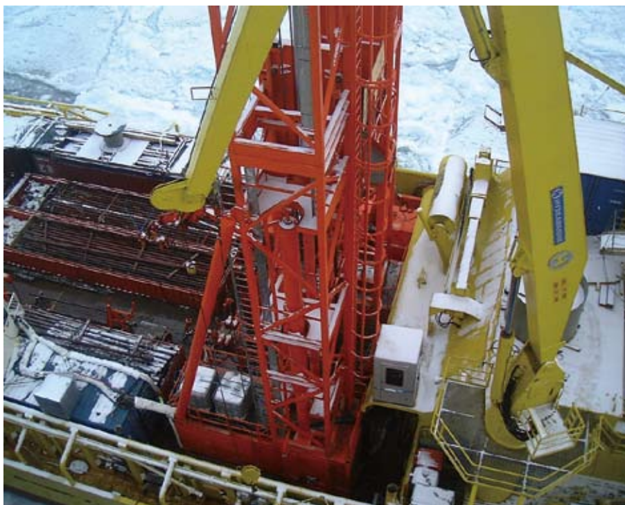
Figure 3. A cold evening – view onto the work deck of the Vidar Viking .

The Vidar Viking was too small to host the drilling operation and the science party (Fig. 3). The Oden became the nerve center for ice and scientific operations, with scheduled personnel transfers between vessels as required. Furthermore, only a subset of the full science party sailed on the expedition. Cores were not split on board. The main scientific component of the expedition took place at the University of Bremen after the expedition was completed and the cores sent ashore for examination by the full scientific party.