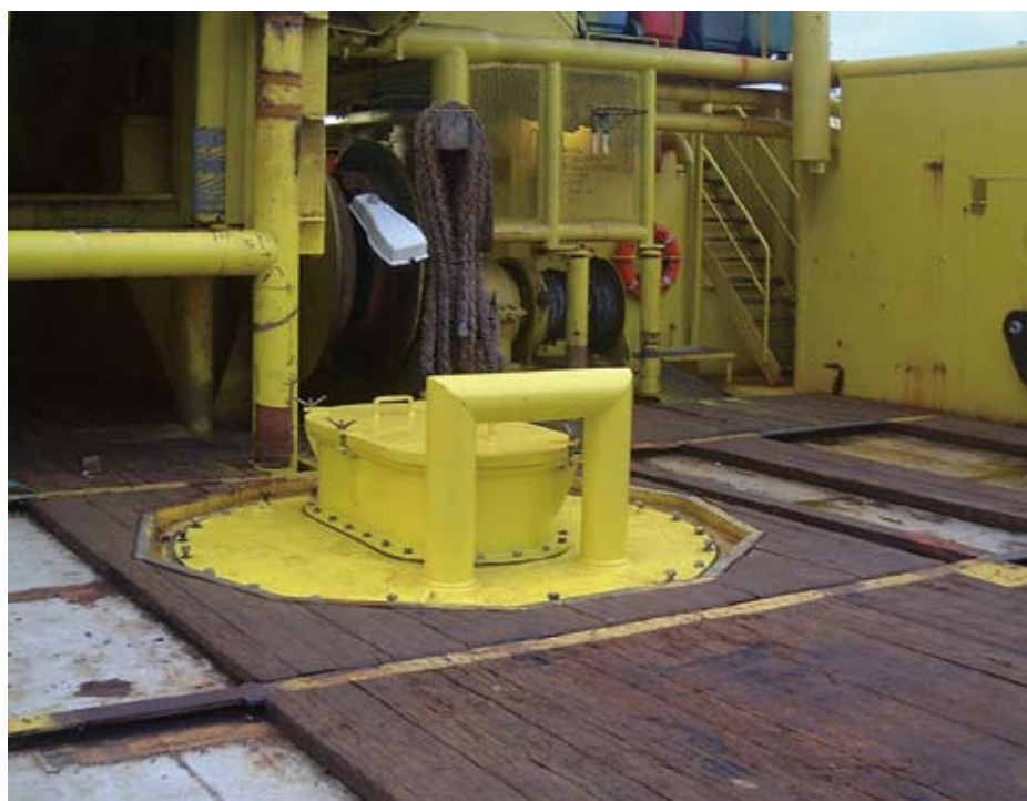
Figure 4. The moonpool returned to a chainlocker at the end of demobilization.

After ACEX, it appeared that Expedition 310 to Tahiti would be a much more straightforward project