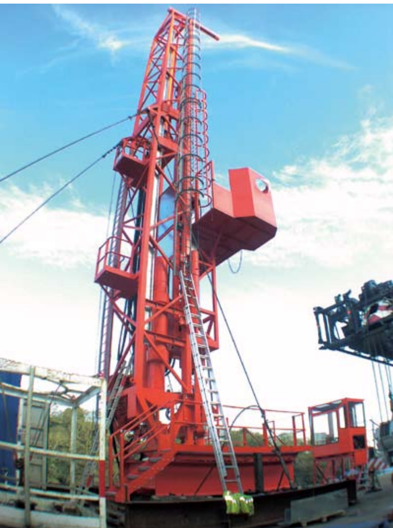
Figure 2. The R-50 rig assembled in the Seacore yard in Cornwall.

The area best suited for this phase of the program is the James Ross Basin, located in the northwestern Weddell Sea region, offshore of Seymour Island (Fig. 4). This is the area initially identified by the SHALDRIL group as having shallow drilling targets of great scientific value, existing