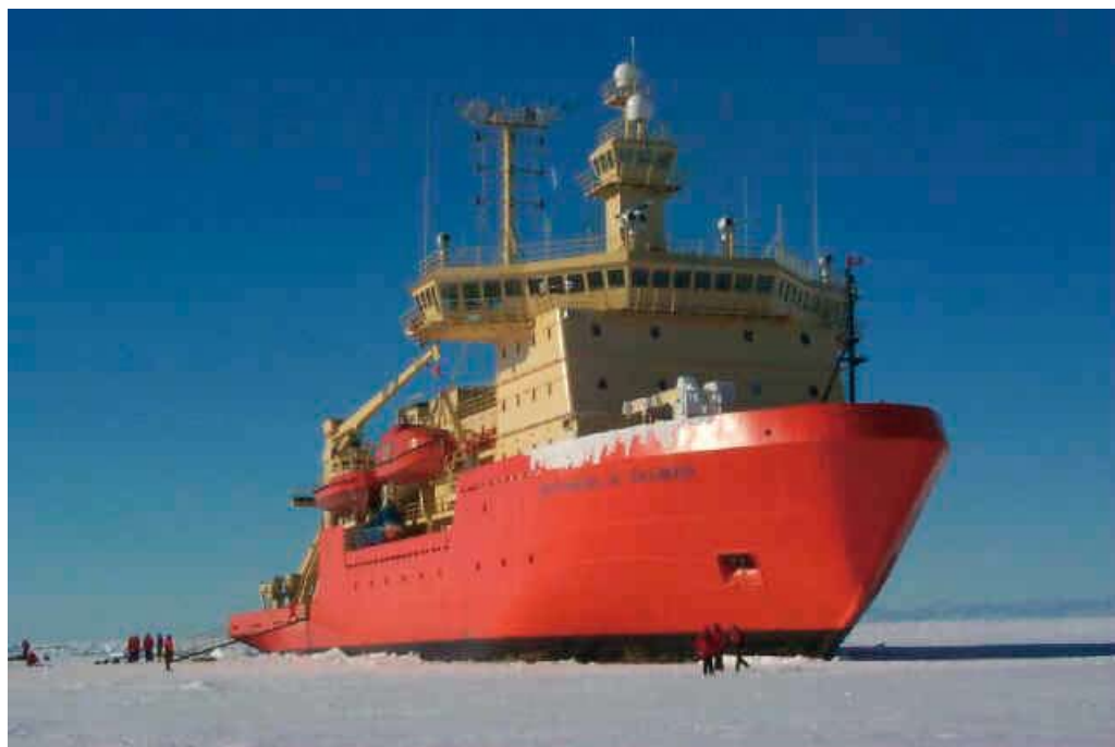
Figure 1. The Nathaniel B. Palmer in ice.

In 2003, a contract was signed with Seacore Ltd. (U.K.) to conduct the drilling operations for SHALDRIL. This choice was made after evaluating all of the companies then operating shallow coring systems, and it was based on the capabilities of heave-compensated rig systems, sampling tools, mobility, availability, and cost. The rig built for SHALDRIL is called the R-50 (Fig. 2) and is similar to, but slightly smaller than, the rig used recently on IODP Expedition 302 in the Arctic (ACEX), also built by Seacore. The rig is completely modular and can be rapidly mobilized as container freight. The rig has the capacity to take 100 m of core in up to 1000 m of water and longer cores in shallower water. The SHALDRIL rig has a 3-m heave compensator that will allow drilling to continue in any type of seas in which people can realistically work, and it will be mounted over a moonpool in the starboard deck of the Palmer (Fig. 3). The position of the rig close to midship will help minimize heave as compared to drilling over the stern. The moonpool will protect the drillstring from stray bits of floating ice and will ensure that ice does not accumulate in the moonpool during drilling.