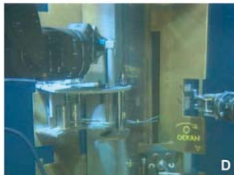
Figure 3. Photos of CORK operations during and after IODP Expedition 301. (A) CORK body being hoisted across the pipe racker to the rig floor. The pressure monitoring and sampling bay is visible; each CORK head has three bays, one each for pressure, fluid chemistry, and microbiology. (B) Below the rig floor, many hours of preparation are required to run hundreds of meters of packer inflation, monitoring, and sampling lines along side the 4-1/2" CORK casing. In this image, the tubing is broken out of the umbilical and is being run through the main CORK seal near the base of the CORK body. (C) OsmoSamplers attached to the CORK head prior to deployment. (D) IODP Expedition 301 CORK systems were visited three weeks after the end of drilling operations by ROV, to assess the state of the observatories, close valves left open during deployment to vent air, install pressure monitoring instrumentation (as shown), and collect short-term osmotic samplers.

hydrogeologic and related experiments, IODP Expedition 301, Eastern Flank of Juan de Fuca Ridge. In Fisher, A.T., Urabe, T., Klaus, A., and the Expedition Scientists, Proc. IODP 301: College Station TX (Integrated Ocean Drilling Program Management International, Inc.) .