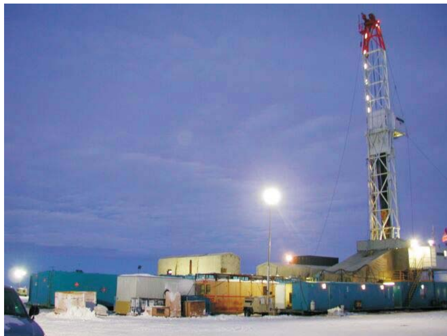
Figure 1. The Mallik Gas Hydrate Research project drill site at the northern edge of the Mackenzie River Delta, Northern Territories Canada. The Mallik project was one of the first ICDP projects containing a deep biosphere component.

Topics for deep biosphere research in terrestrial systems. With the discovery of deep microbial ecosystems in sedimentary basins—as well as microbial life in granites, deep gold mines, and oil reservoirs—the view of the scientific community was opened to a hidden and largely unexplored inhabited realm on our planet (Fredrickson and Onstott, 1996; Parkes et al., 2000; Pedersen, 2000; Sherwood Lollar et al., 2006). From a surface point of view the deep subsurface is an extreme environment. With increasing burial depth, microbial communities have to cope with increasing temperature and pressure, nutrient limitation, limited porosity and permeabil-