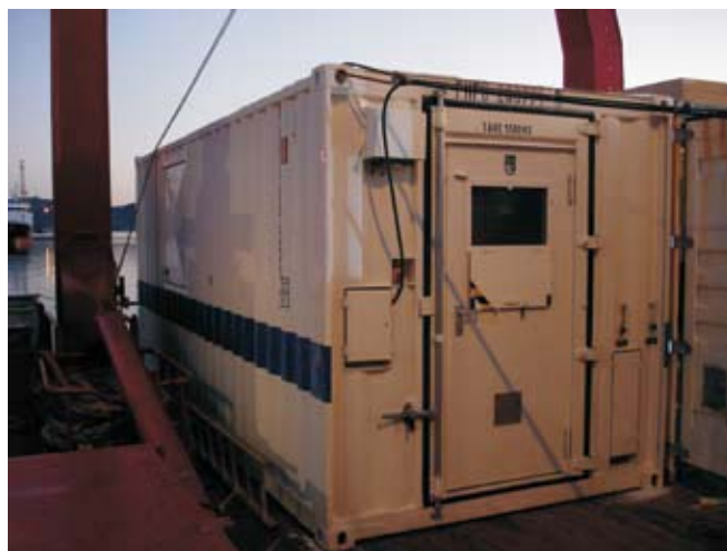
Figure 3. The GFZ BUGLab container is a mobile field laboratory for geomicrobiological and biogeochemical research. The container can be deployed in a wide range of both marine and terrestrial settings, from polar to tropical environments.