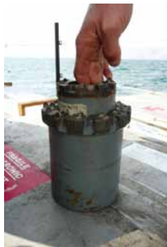
Figure 3. Extended-nose coring tool with outer and inner core bit. Most of the cores were retrieved with this tool.

The project is performed under the wings and support of the International Continental Scientific Drilling Program (ICDP). The drilling operation is performed by DOSECC.