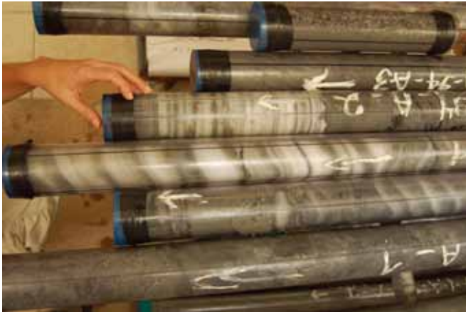
Figure 2. Drill cores in liners recovered at depth around 300 m below lake floor. From top to bottom the cores show change from gravel (top core) to marls interlaced with fine-grained salt layers (middle cores). This suggests that at that time the shore was very close to the drilling site, and the wavy salt patterns were interpreted as a result of salt flow.

plementary record to the sections recovered from the marginal terraces, particularly for time interval of low lake stands when the lake retreated from the marginal terraces. The calcium chloride brine that was produced during the ingress of the Sedom lagoon is poor in bicarbonate and sulfate, and therefore, when freshwater enters the lake, primary aragonite is deposited. The aragonite provides an excellent and unique means to achieve calendar chronology down to a few hundred thousand years. This illustrates a major advantage of the sedimentary archive of the Dead Sea and allows comparison to global records such as ice cores and deep sea cores. Data from core samples will establish a pattern of abrupt hydrological events in the drainage area, and the brine-freshwater relations during the different stages will be explored to evaluate effects of long-term climatic trends versus short-term fluctuations.