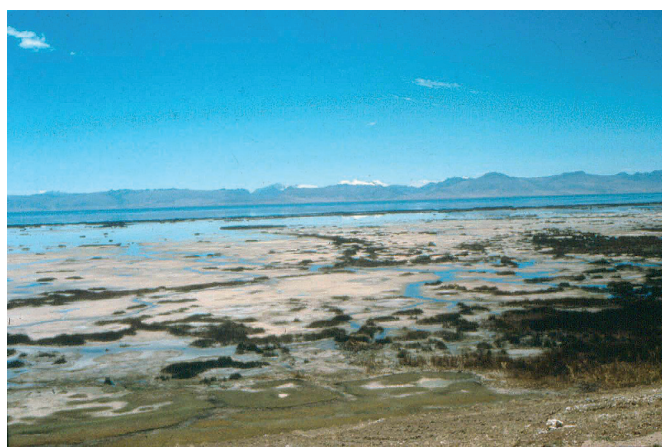
Figure 2. Marl exposed during the dry season along the western edge of Lake Junin; view is looking east across the lake to the eastern cordillera. The marl exposed in this photograph has precipitated on the leaves of rooted macrophytes and has accumulated to form a bioherm several meters thick. The glacier-clad summits in the distance fed valley glaciers that reached the eastern edge of Lake Junin on several occasions in the last million years (Smith et al., 2005a, 2005b).

Lake Junin sits within a fault-bounded subsiding intermontane basin between the eastern and western cordillera of the central Peruvian Andes. Bedrock is dominated by late Paleozoic to Mesozoic carbonates, although glacial erosion of the eastern cordillera has exposed pre-Cambrian crystalline rocks. The lake basin, with a maximum water depth of ~15 m, is dammed at its northern and southern ends by coalescing alluvial fans that emanate from glacial valleys in both cordillera. These fans can be traced to moraines that