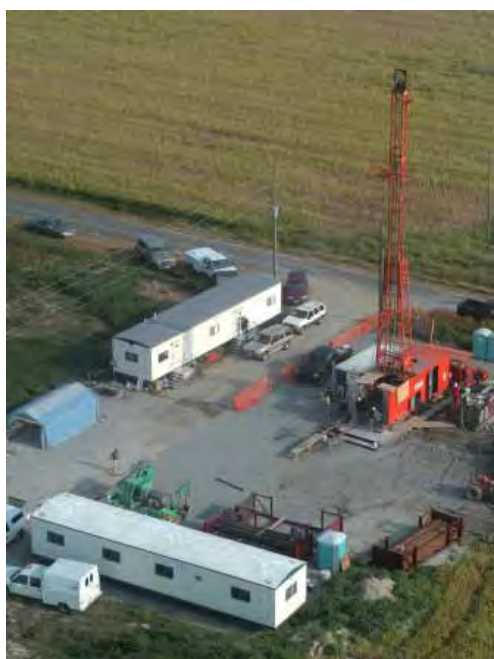
Figure 3. Low-altitude aerial photograph of Eyreville drilling site.

The huge unexpected megablock of granite encountered at Eyreville presents an example of challenging decision making during the drilling of large impact structures. The coring of hundreds of meters of granite across numerous days suggested that the crater floor already had been penetrated at an unexpectedly shallow depth according to geophysical data. However, it was decided to continue drilling, and ultimately the base of the granite was reached, below which a section of suevitic breccias was encountered (Table 2), confirming that the block had been transported a great distance during the impact event.