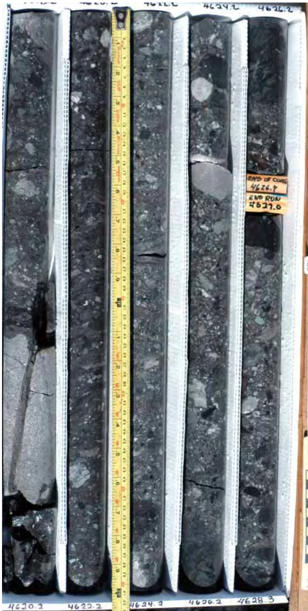
Figure 4. Suevitic and lithic breccia from Eyreville B borehole.