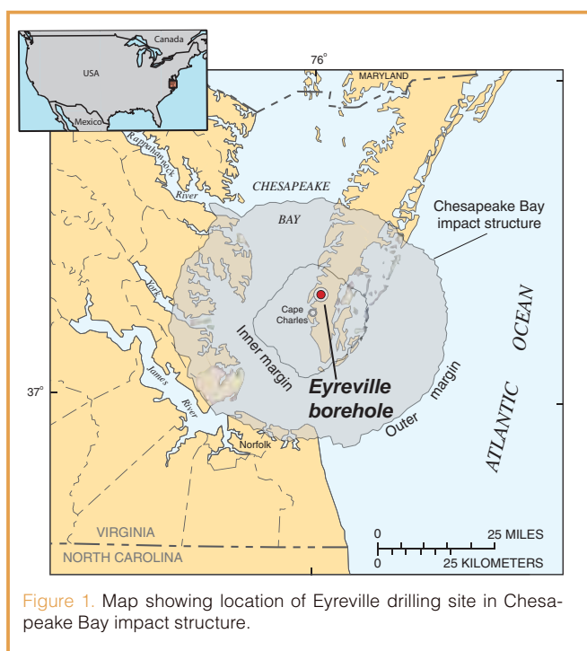
Figure 1. Map showing location of Eyreville drilling site in Chesapeake Bay impact structure.

The presence of salty groundwater throughout the impact structure is of significant interest to hydrologists studying the future availability of fresh water in the densely populated urban corridor located along the south and southwestern margins of the structure. Topics of immediate interest that are addressed by the deep borehole include the physical disruption of the aquifer system by the impact, the