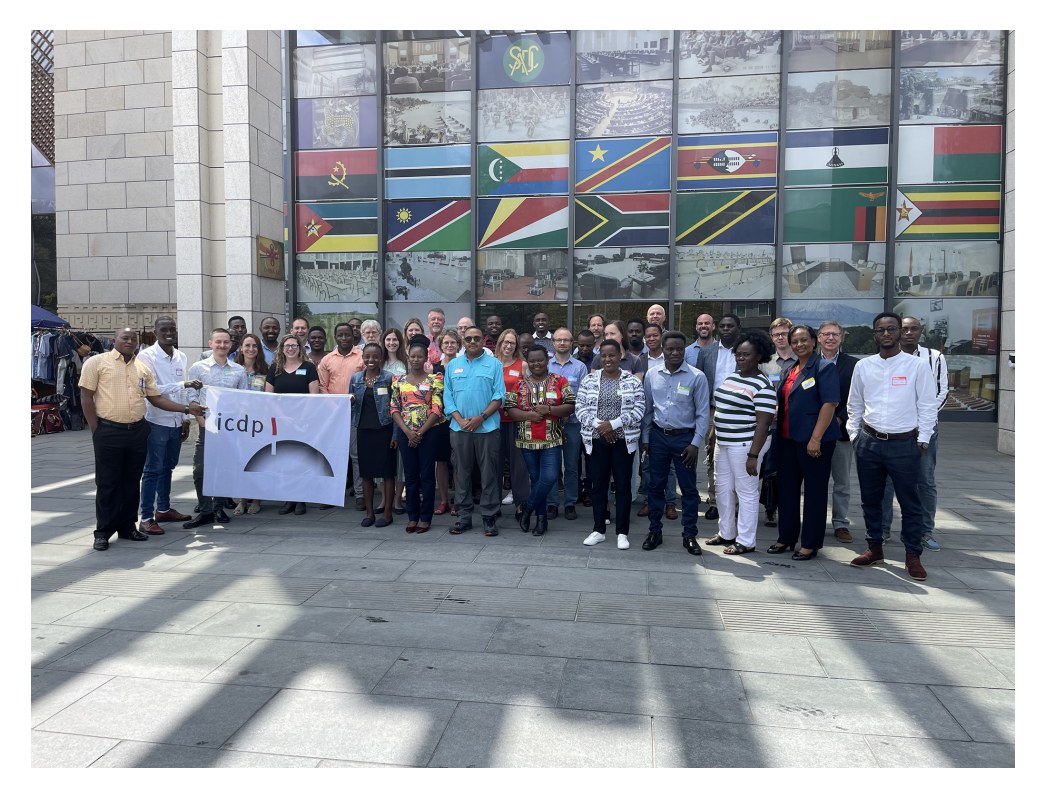
Figure 2. Group photo of LVDP workshop participants at the Julius Nyerere International Convention Centre in Dar es Salaam, Tanzania.

gional climate and evaporation and rainfall on Lake Victoria makes the lake highly sensitive to climate forcing factors such as insolation, SSTs, and atmospheric greenhouse gas levels. This in turn means that intervals when the lake is significantly different in size have profound effects on regional climate, which causes major, nonlinear, and abrupt increases and reductions in lake size (e.g., Beverly et al., 2020). Further, in contrast to the long, narrow, and deep rift lakes with large border faults forming half-grabens (Malawi (750 m), Tanganyika (1500 m), and Turkana (110 m)), Lake Victoria's shallow depth ( \sim 70 m) and large surface area likely result in very different catchment processes (e.g., Beverly et al., 2020) and responses to climate change than the large and deep rift lakes.