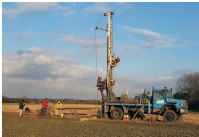
Figure 2. Coring at the Wunstorf drill site in March 2006.

The Wunstorf core was successfully drilled in early March 2006 by a truck-mounted mobile drilling system in a five-day campaign (Fig. 2). The 80-m-long core, which had excellent recovery (>98%), is now stored in the Bremen Core Repository (BCR). Subsequently downhole logging has been conducted with a broad variety of logging tools—including spectral gamma ray, density, neutron porosity, geochemical logging, sonic, borehole televiwer, resistivity, induced polarization, dipmeter, susceptibility, temperature, and salinity—and will be integrated with the core logging data.