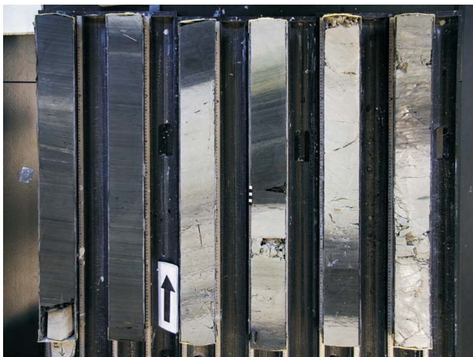
Figure 3. Meters 44 to 38 of the Wunstorf core showing dark laminated black shales.

The core description and the gamma-ray data from downhole logging revealed eight to nine short-termed, potential eccentricity cycles (100 ky) for the 26.5-m-thick OAE 2 black shale succession, giving a duration of 850 ky for this interval with a mean sedimentation rate of \sim 31 \text{ m My}^{-1} .