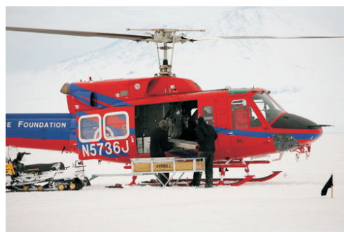
Figure 3. ANDRILL sediment cores were flown by helicopter daily from the drillsite to the Crary Science and Engineering Center at McMurdo Station.

Programs like ANDRILL can help constraining uncertainties about the future behavior of Antarctic ice sheets and resultant sea-level change. These stratigraphic records will be used to determine the behavior of ancient ice sheets and to better understand the factors driving past ice sheet, ice shelf, and sea-ice growth and decay. This knowledge will enhance our