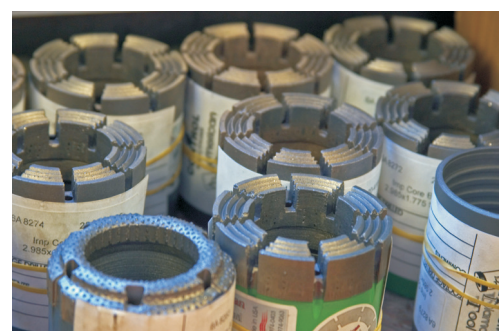
Figure 4. Diamond-impregnated drilling bits enable the ANDRILL drilling system to recover high-quality core, with up to 98% core recovery through glacial and glaci-marine sediments.

understanding of Antarctica's potential responses to future global climate change. With this in mind, the ANDRILL scientific and operations teams continue to plan for future scientific progress using the ANDRILL system through field-based site surveys, scientific planning, and technological developments. ANDRILL's capabilities are expanding to operate from an ice shelf platform several hundred meters thick and moving at a rate of more than two meters per day. The ANDRILL teams are also assessing the feasibility of reentering a drill hole, following relocation of the drilling rig and drill site science facilities. In the meantime, the science team members involved in the MIS and SMS projects are actively studying the drill cores and reporting initial results (Harwood et al., 2006, 2008; Naish, et al., 2007a, 2007b, 2008). These results are vital to SCAR's (Scientific Committee on Antarctic Research) ACE (Antarctic Climate Evolution) program ( www.ace.scar.org ), whose objectives are to integrate geological and paleoclimatic data into climate and ice sheet models to constrain estimates of Cenozoic ice volume variability, and terrestrial and marine paleotemperatures.