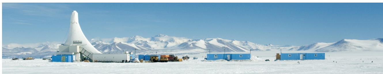
Figure 1. Panoramic image of the ANDRILL drilling rig and science laboratories in Southern McMurdo Sound during late 2007, operating from a 8.4-meter-thick sea-ice platform. Transantarctic Mountains are visible in the background.

In addition to the 600-m-thick middle Miocene interval (800–223 mbsf) , the AND-2A drill core also recovered an expanded lower Miocene section (1138.54 up to c. 800 mbsf) through an interval previously recovered during the Cape Roberts Project and an upper Pliocene to Recent interval (223 mbsf to 0.0 mbsf) that is thinner but correlative to parts of the Upper Neogene section recovered by the ANDRILL MIS Project in drill core AND-1B. Abundant volcanic clasts and tephra layers in the core, also provide the materials to document the 20-million-year evolution of the McMurdo Volcanic Province including several previously unknown explosive volcanic events.