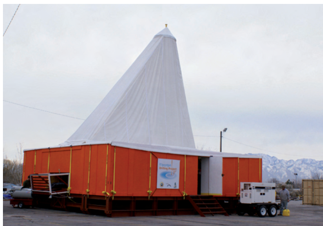
Figure 2. The new "Russian"GLAD assembled and modified by DOSECC in Salt Lake City in consultation with Alex Pyne (Antarctica Research Center, New Zeland).

by way of Vladivostok. Traversing the DOSECC drill rig and all supplies, pipe, and equipment from Pevek to Lake El'gygytyn requires a 360-km overland bulldozer-supported trek after the rivers and tundra are well frozen and can sustain heavy loads. Most of the field party will reach the lake by helicopter out of Pevek.