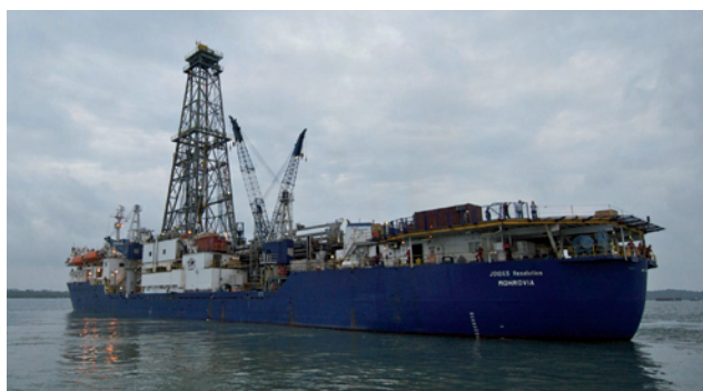
Restored JOIDES Resolution ready for sailing. (Departing from Singapore)

The JOIDES Resolution —a 20-year workhorse on behalf of scientific ocean drilling—sailed away from a Singapore shipyard on 25 January after a complete transformation to modernize and upgrade the ship. To get the JR into the shape she's in now has taken years of diligent effort by a talented team of project managers, dozens of IODP-USIO staffers, thousands of skilled shipyard laborers (averaging roughly 350 per day), and more.