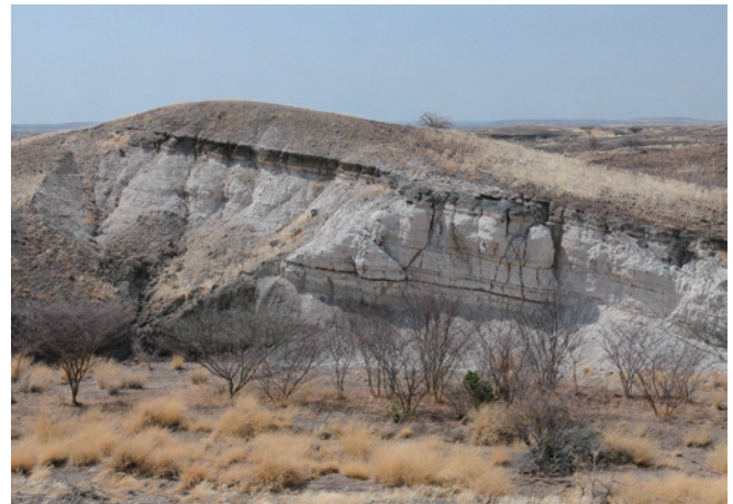
Figure 3. Outcrop photo of Middle Pliocene laminated diatomites from near the depocenter of a paleolake in the Northern Afar, one of the likely target locations and intervals for HSPDP drilling. Hill is about 8 m high.