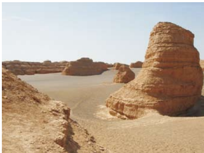
Figure 2. Wind-eroded landforms in the Yadan National Geological Park, Gansu Province, China, resulting from the dryness of a paleolake over the Pliocene-Pleistocene climate transition. Decreasing regional rainfalls are supposed to be closely tied to the Himalayan uplift associated to changes in the atmospheric pattern.

the latter have had on global climate and ice sheet extension?